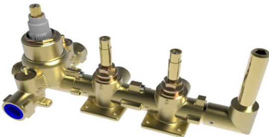
Immagine Prodotto - Product Image