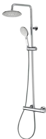
Immagine Prodotto - Product Image

настенная колонна из латуни Ø 20 мм – Душ AGUA Ø 210 мм из ABS - AGUA LIFE Ручная лейка - держатель для лейки поворотный - шланг Cromolux 150 см подключение FF - Смеситель терmostатический с встроенным переключателем