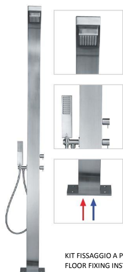
KIT FISSAGGIO A PAVIMENTO FLOOR FIXING INSTALLATION KIT