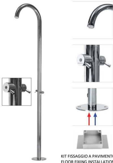
KIT FISSAGGIO A PAVIMENTO FLOOR FIXING INSTALLATION KIT