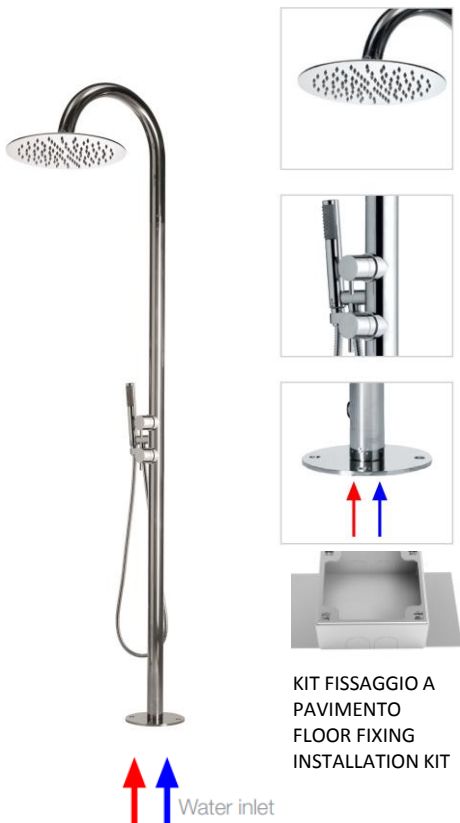
Immagine Prodotto - Product Image

Душевая колонна TETIS из стали INOX Душевая колонна укомплектована: Комплект для крепления к полу и подключению к водоснабжению (горячему и холодному) - 2 смесителя - Душ 4 мм TETIS диам. Ø250 мм - Ручной душ